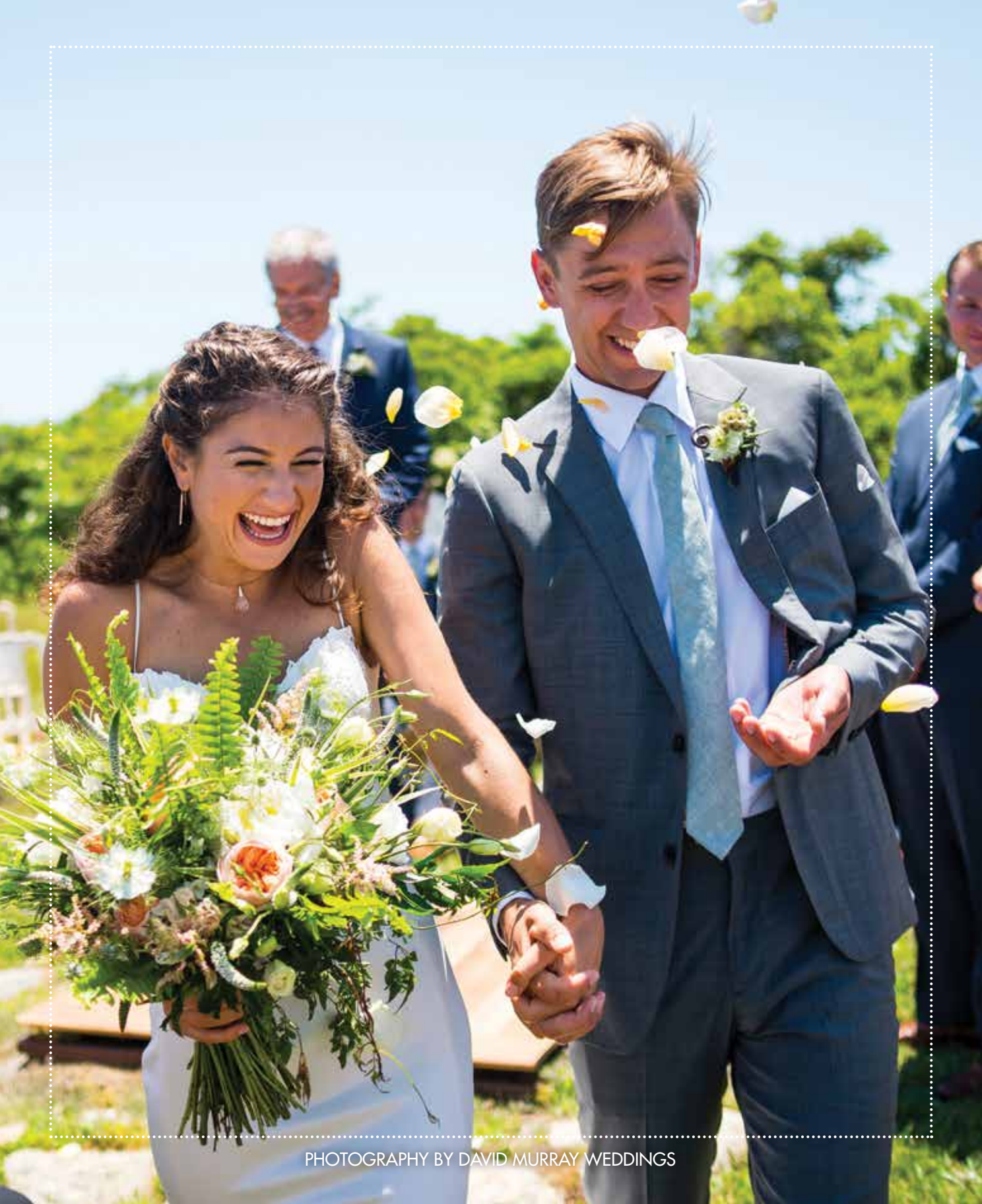
PHOTOGRAPHY BY DAVID MURRAY WEDDINGS